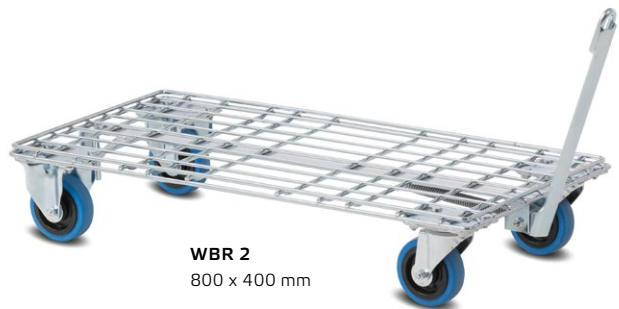
WBR 2 800 x 400 mm