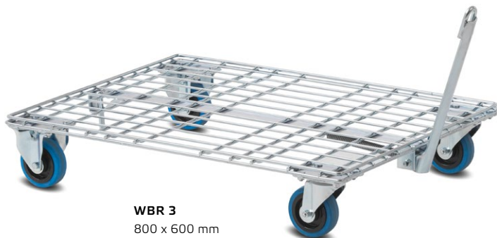
WBR 3 800 x 600 mm

Standard equipment: Support surface made of mesh grate. Coupling drawbar for coupling of multiple floor rollers.