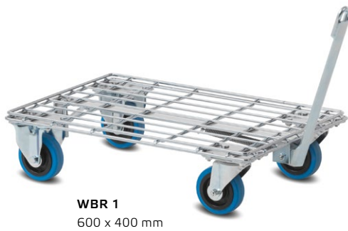
WBR 1 600 x 400 mm